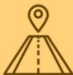
Black Top Road